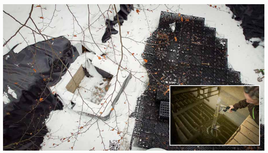
The constructed vertical wetland combined with water accumulation. In detail - taking a sample from the elephant enclosure

to-day operation of the system will also require a reliable supply of energy, another issue that Dr Kvapil and his colleagues are addressing in the project. "We need energy to operate the water treatment plant and the pumps, to distribute water all over the zoo," he acknowledges. Researchers know how much energy the LIFE4ZOO system will require, and solar panels have been installed on the roof of the entrance to Liberec zoo, a partner in the project where the technology will be trialled. "We have calculated